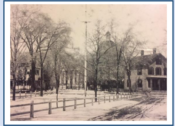
Franklin Square on a cold winter day. Circa 1900.

Please reserve tickets by calling 781.326.1385, sending a check to Dedham Historical Society & Museum, P.O. Box 215, Dedham, MA 02027, or sending an email to Info@DedhamHistorical.org . If you are unable to attend, please consider a donation to DHSM. Please join DHSM for this important—and fun—fundraiser.