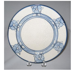
375 th Commemorative Plate Wild Rose Plate