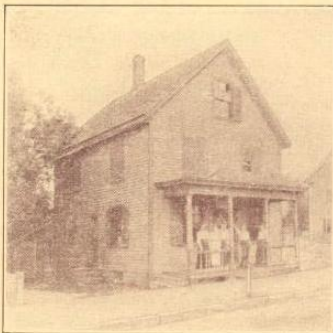
SITE OF OLD LAUNDRY ON HIGH STREET—PICTURE TAKEN IN 1899

Commencing with one horse and wagon for delivery there are now thirteen (13) trucks and drivers covering a radius of 12 miles, and during the summer months cover South Shore to Scituate. We boast of careful drivers, as we hold a diploma given by Commonwealth of Massachusetts for no accidents for the first six months of 1930. There are about sixty people employed. (Editors Note: the laundry was left to Goldie Swett Garlick upon the death of her mother, Bertha. The laundry closed in 1980 and the building was destroyed by fire in 1981.)